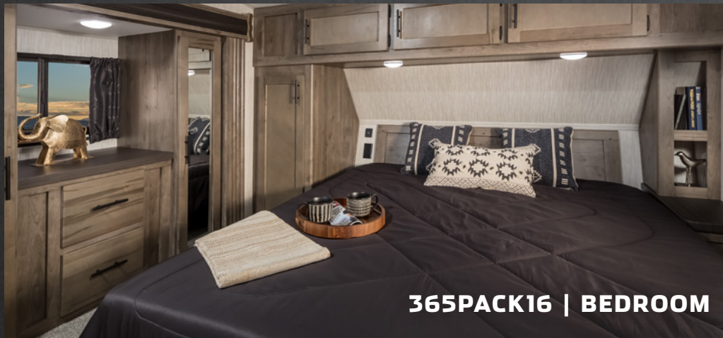
365PACK16 | BEDROOM